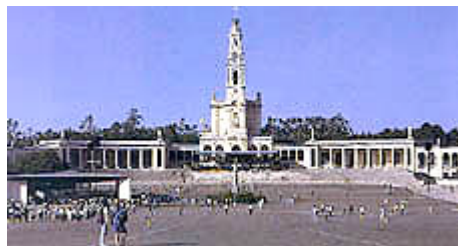
Pray the Rosary for Peace.

Credit Card information on top part of form, with a panoramic view of the Sanctuary at Fatima on the bottom part of the form.